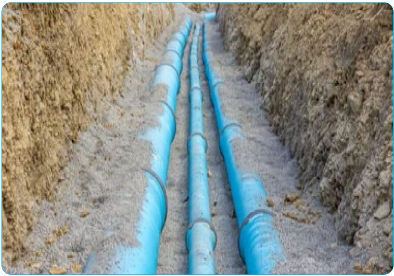
Pipes in a water project in Lindi

Number of days within which a procuring entity and the successful tenderer shall enter into formal contract, after fulfilling conditions.