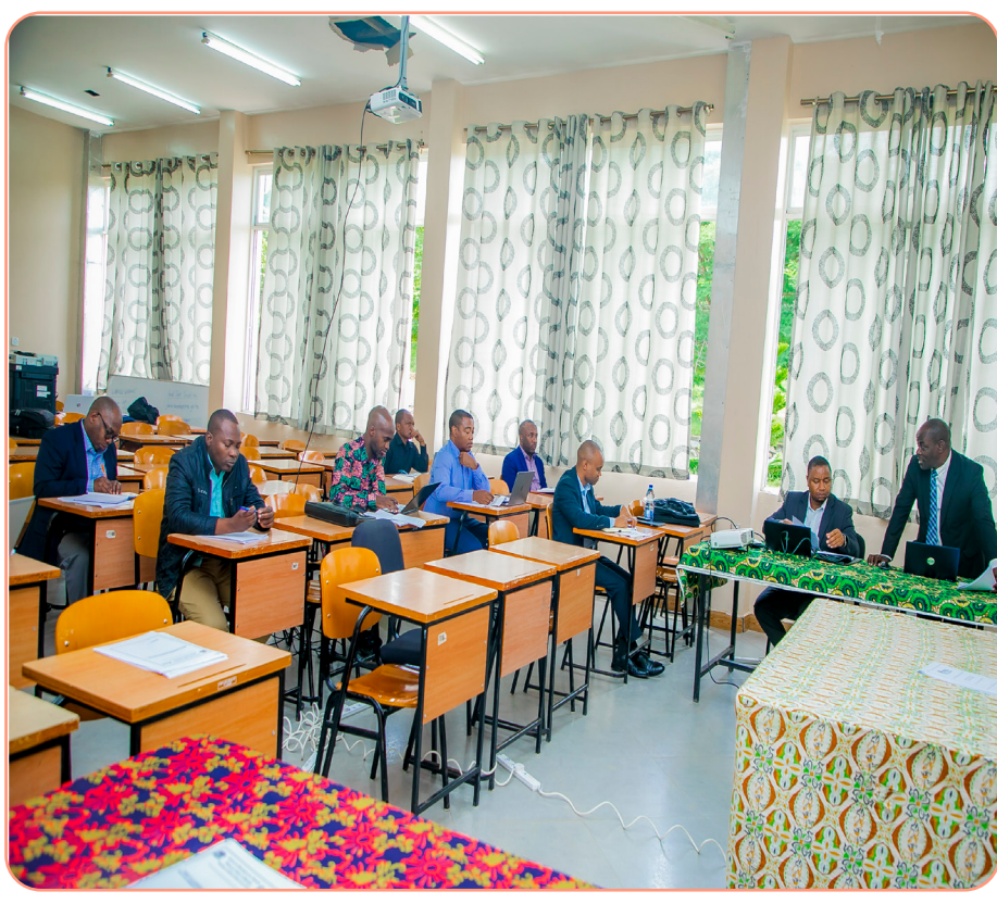
National e-Procurement System of Tanzania (NeST) Technical Committee's meeting in progress